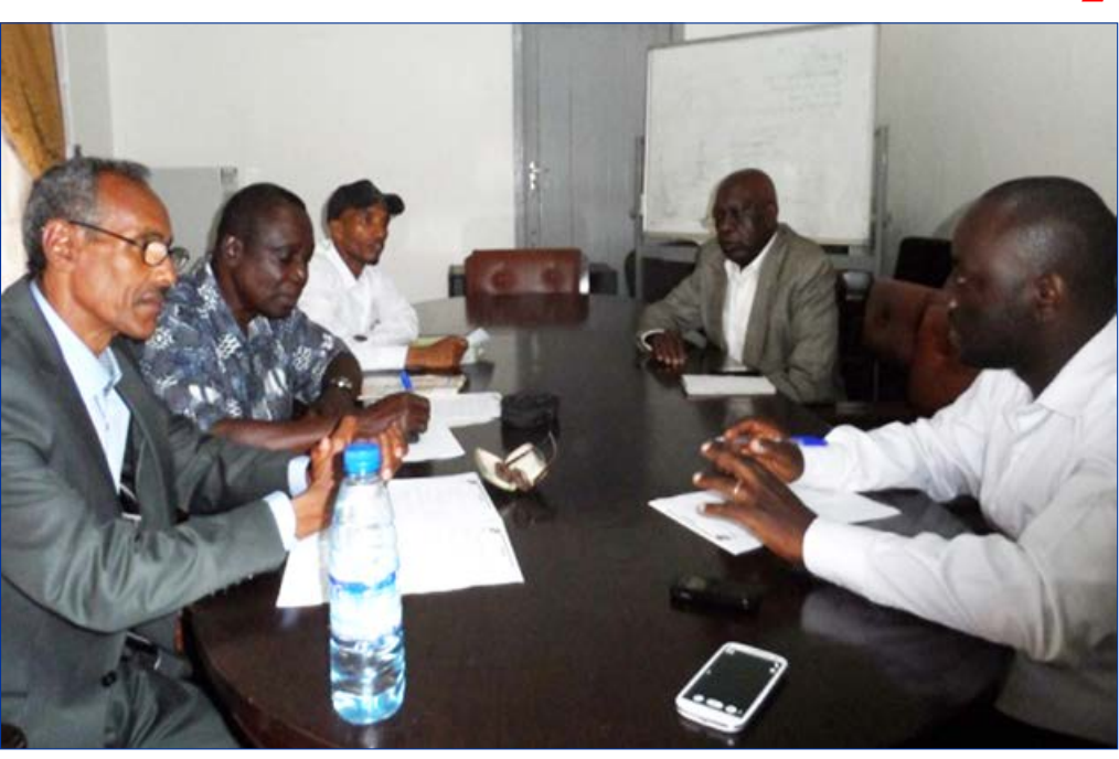
Chairman of Board of Directors of TUNADO and the Executive Director in a meeting with The Eritrean delegates and

for example, were exceptional. All throughout the 5-day exhibition period, I had good interactions with the exhibitors, beekeepers, processors and people from academia and donor agencies. The Processors Forum offered a good platform for knowledge sharing. I had a good opportunity to address the meeting, sharing my experiences in beekeeping and also my research work on pollination services offered by bees. I made particular reference to my study of the benefits of integrating beekeeping into cashew farms in Benin