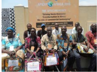
Some of the Participants pose for a photo